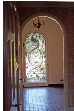
The metalwork inside the designer showhouse is one of its most notable features.