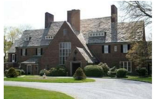
The home to be featured in this year's Stately Homes By-The-Sea, a fundraiser run by the Visiting Nurse Association of Central Jersey, is Sheep's Run in Rumson.

"Another showhouse allows us to raise awareness of the services of VNACJ and allows us to raise funds to fulfill our mission to provide everyone who needs care in the home and out, to get that care," she explained.