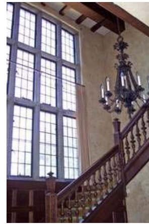
A stairway window and chandelier.